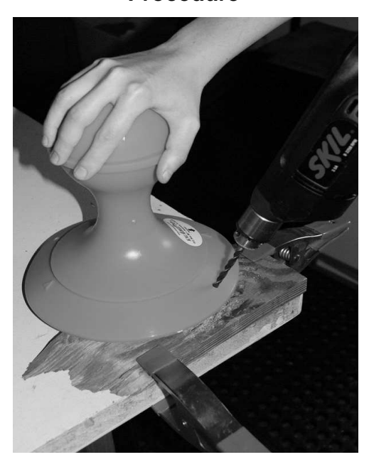
1. Drill one hole 3/4 of an inch in from the outside rim at opposite sides of the dispenser's base. The holes to be drilled should conform to the size and kind of bolt or fasteners to be employed.