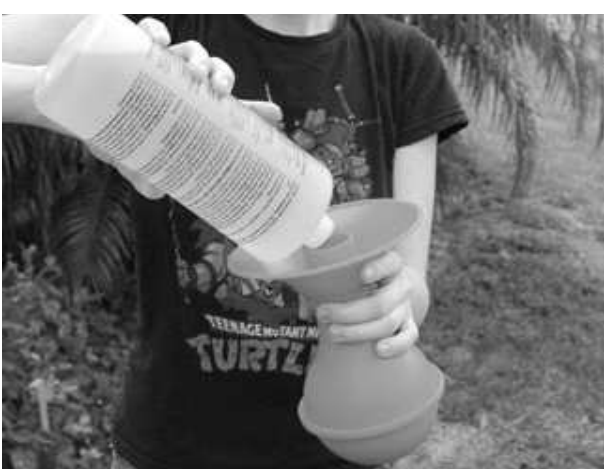
4. With the flow switch removed the reservoir can be filled with up to 19 ounces of liquid insect bait while the dispenser's base remains securely locked in place.