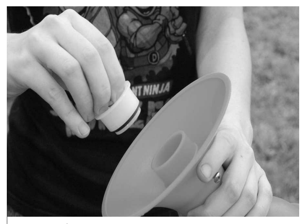
3. The flow switch is inserted into the throat of the dispenser's mid body.