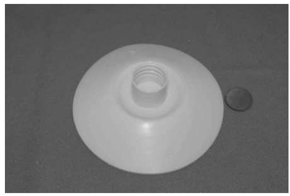
Base with gasket removed from center.

2. Remove rubber sealing gasket from the dispenser's base receive by lightly, but firmly tapping the base upside down against a hard surface. If it does not readily fall out, use a pointed metal instrument to pick it out.