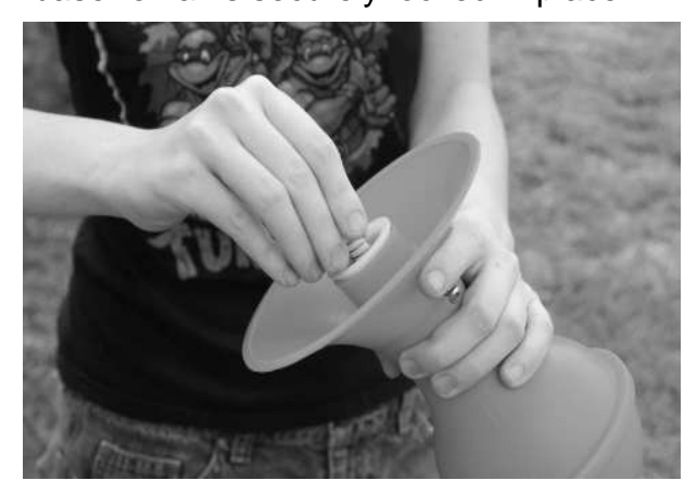
5. After filling the reservoir insert the flow switch. Apply even pressure until the overlapping rim of the switch is seated flush against the throat of the dispenser.