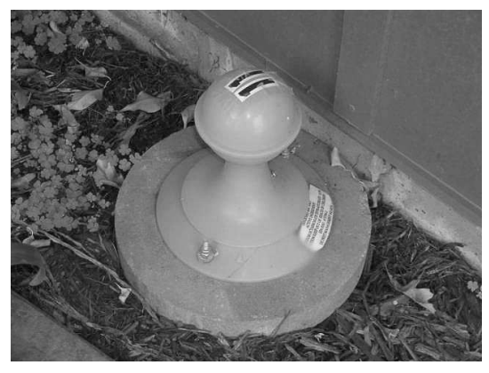
Dispenser deployed around public housing.